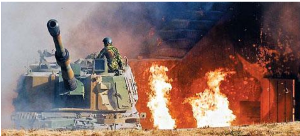
Fig 4: Damage at the marine base

A K-9 Marine artillery base on Yeonpyeong Island under attack by North Korea on Tuesday ["N.Korean Shelling 'Aimed for Maximum Damage to Lives, Property'." Chosun Ilbo , 26 November 2010.