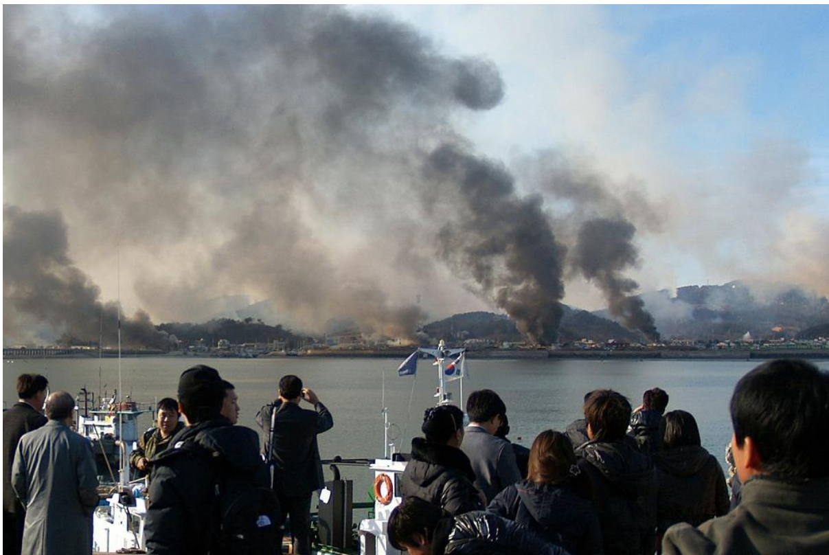
Fig3: Smoke from rocket fire over Yeonpyeong island

This picture taken on November 23, 2010 by a South Korean tourist shows huge plumes of smoke rising from Yeonpyeong island in the disputed waters of the Yellow Sea on November 23, 2010. North Korea fired dozens of artillery shells onto a South Korean island on November 23, 2010, killing four people, setting homes ablaze and triggering an exchange of fire as the South's military went on top alert.