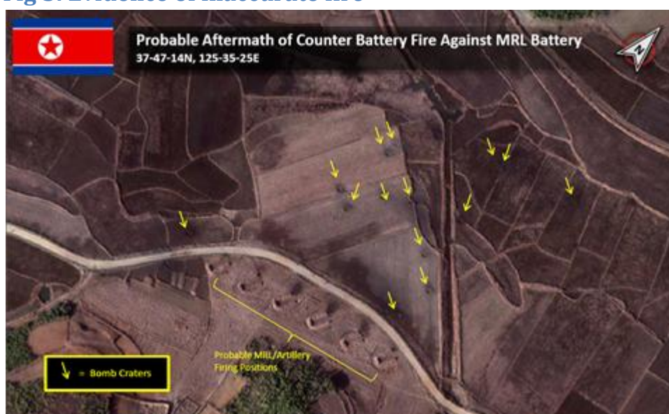
Fig 5: Evidence of inaccurate fire

Committee members reportedly reacted angrily since they show impact points scattered mainly in paddy and dry fields. 84