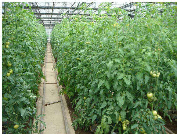
Visit to a greenhouse