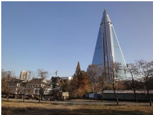
The Ryugyong Hotel (constructed) in Pyongyang

Do you want to explore new business opportunities? From 21 to 27 September 2014, a general trade & investment mission takes place in order to investigate these business opportunities. This tour is open for participants from all European countries, from various business sectors.