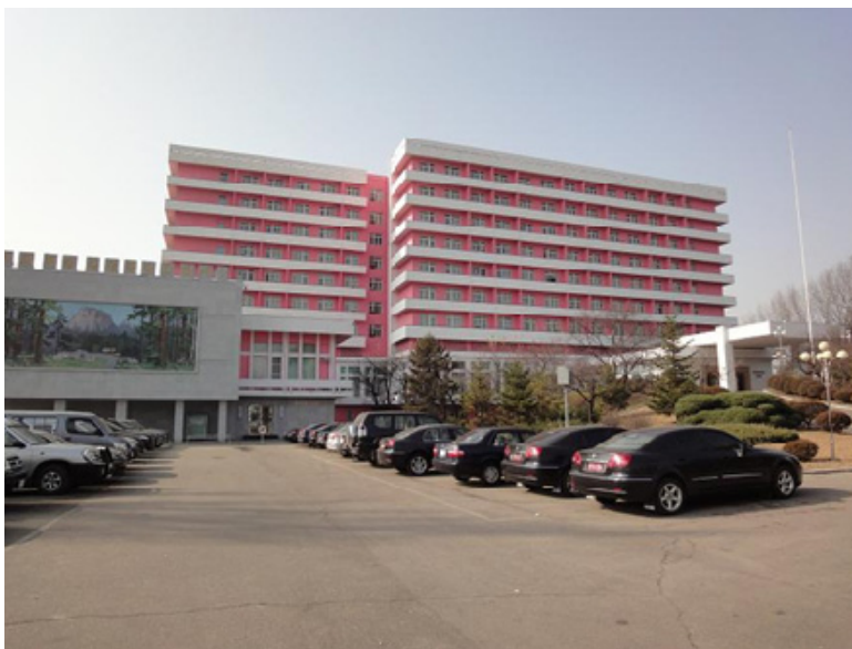
One of the available hotels in Pyongyang