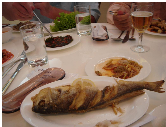
At a local restaurant - an excellent place for informal business discussions