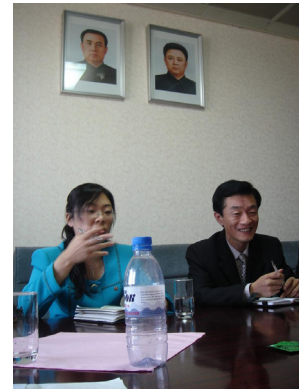
Friendly and informative business meetings