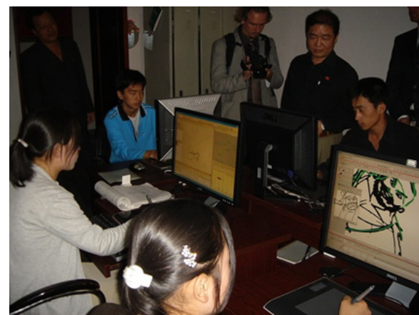
Visit to an animation studio