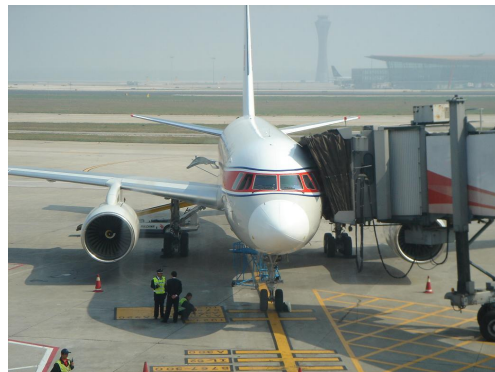
One of the modern planes of Air Koryo

In the morning: visa collection at the DPRK Embassy in Beijing. Receiving Air Koryo airplane tickets. Afternoon: available for an individual program. Tentative: attending the afternoon seminar: "Doing business with DPRK". The event, with several speakers, will address various aspects of doing business in DPRK.