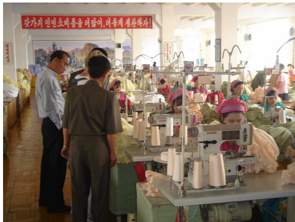
Visits to garments and fabrics factories