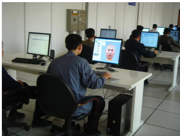
Visit to software company