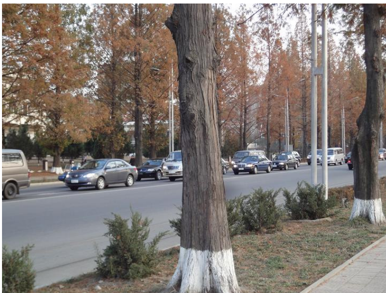
Pyongyang street scene