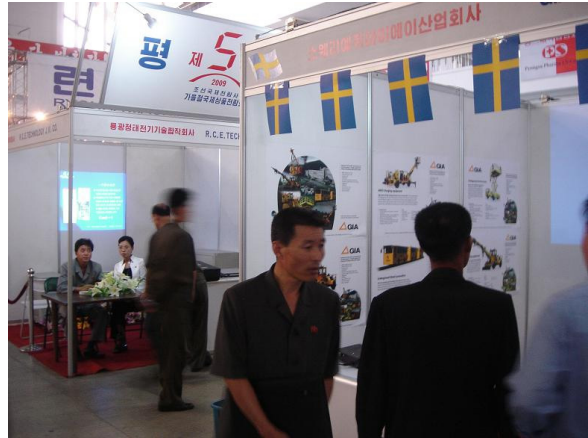
A booth at the fair of a European exhibitor