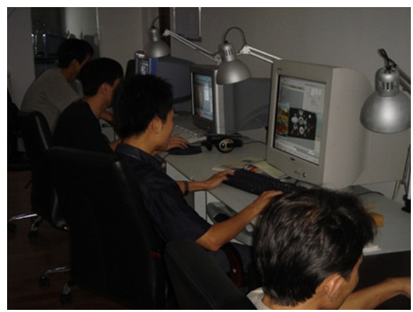
At a graphics design company